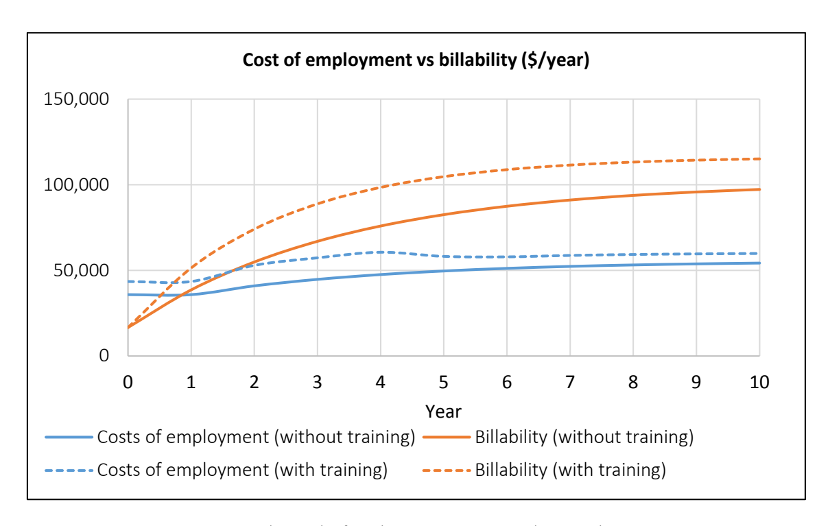
Figure 2: Costs and rewards of employing an inexperienced new worker over time

The investment required to enrol a new employee in a training programme leading to the New Zealand Certificate in Boat Building is approximately $11,000 spread over five years (see appendix). This adds to the costs of employment creating a new cost curve (see Figure 2). Formally trained workers both increase billability faster, and earn more than untrained workers over the long run.