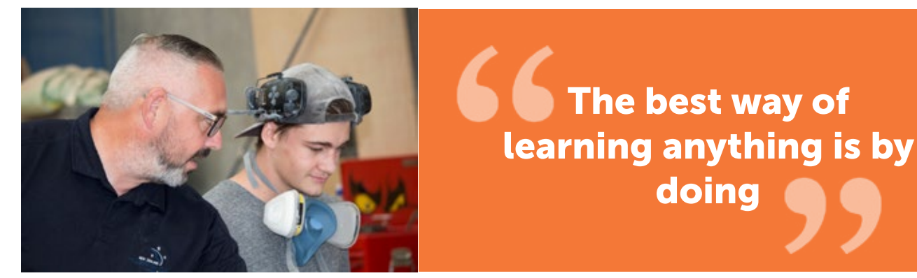
Services and Fees

School to Work Package with administration and assessment by NZMAC ITO No Fee (Conditions Apply)